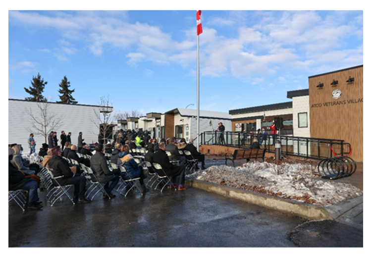
Guests, building partners, supporters and the media gather for the Grand Opening of our Edmonton Veterans' Village

After four years of planning, design, government approvals and construction, our Edmonton Veterans' Village is now complete and started welcoming its first cohort of 20 homeless Veterans on December 1, 2021.